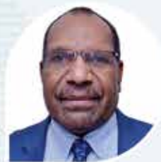
His Excellency Paulias Korn, High Commissioner of Papua New Guinea