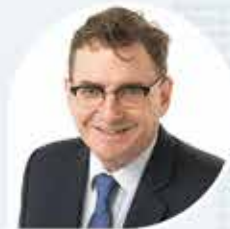
His Excellency David Pine New Zealand High Commissioner